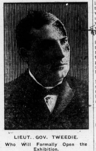
LIEUT. GOV. TWEEDIE. Who Will Formally Open the Exhibition.

OFFICIAL PROGRAMME. Tuesday, September 17th. 9.30 a. m.—The Judges in all departments will commence to make their awards.