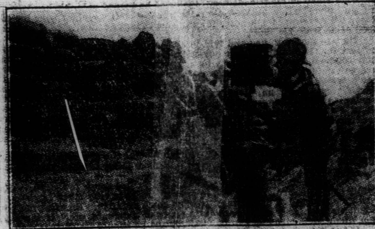
How the Pictures of the Battle of the Somme were Taken.

Hard Colds ---People whose blood is pure are not nearly so likely to take hard colds as are others. Hood's Sarsaparilla makes the blood pure; and this great medicine recovers the system after a cold as no other medicine does. Take Hood's.