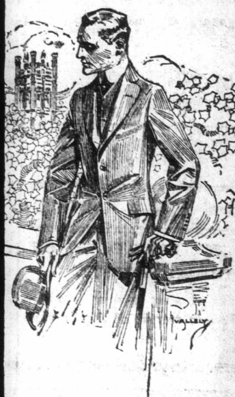
Society Brand Clothes