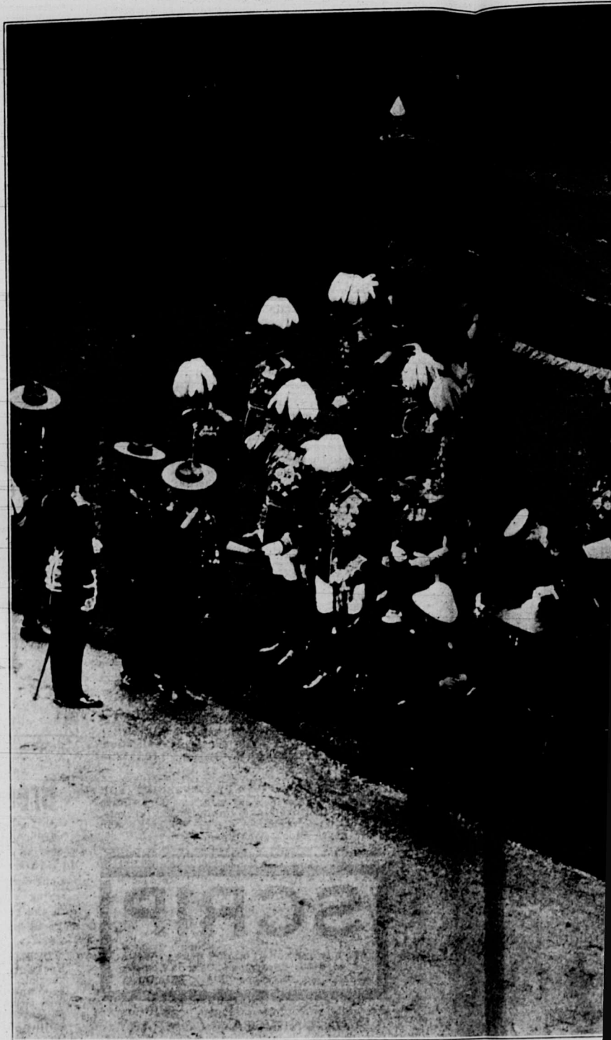
THE KING HONORING THE COLONIAL AND INDIAN MEMBERS OF THE CORONATION FETES IN LONDON. The above illustration shows His Majesty 'medalling' members of the Colonies. At the table H.R.H. the Prince of Wales is sorting the medals, and by his side stands Governor-General-designate of Canada. In the chairs on the right of the picture are seated Kitchener stands beside the King.