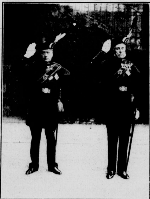
LORD ROSEBURY. EARL OF HADDINGTON