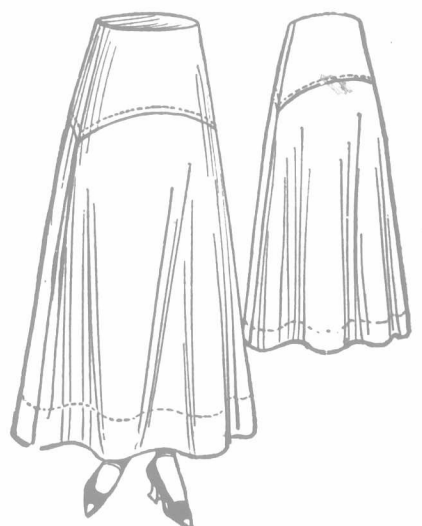
8816 (With Basting Line and Added Seam Allowance) Skirt with Yoke, 24 to 32 waist.