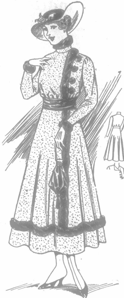
8843 (With Basting Line and Added Seam Allowance) One-Piece Gown in Russian Style, 34 to 44 bust.