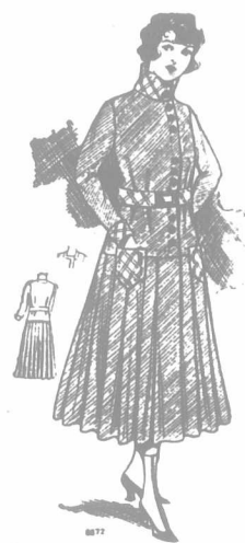
8872 One-Piece Dress for Misses and Small Women, 16 and 18 years.