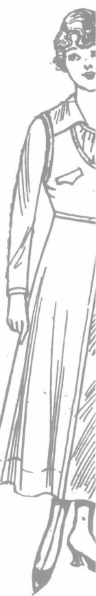
8802 (With Basting Line and Added Seam Allowance) Bodice.