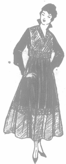
8834 One-Piece Gown, 34 to 42 bust.