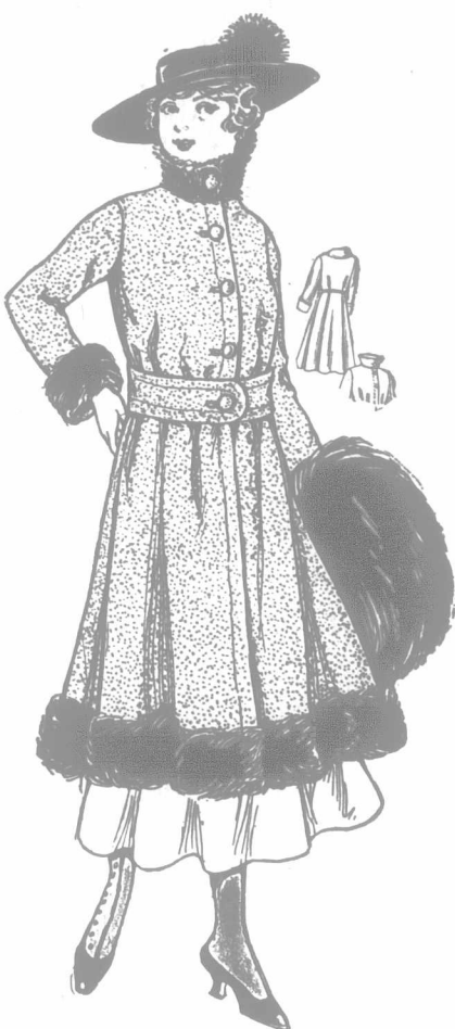
8817 (With Basting Line and Added Seam Allowance) Loose Coat for Misses and Small Women, 16 and 18 years.