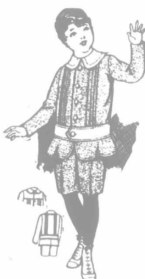
8853 Boy's Suit, 4 to 10 years.