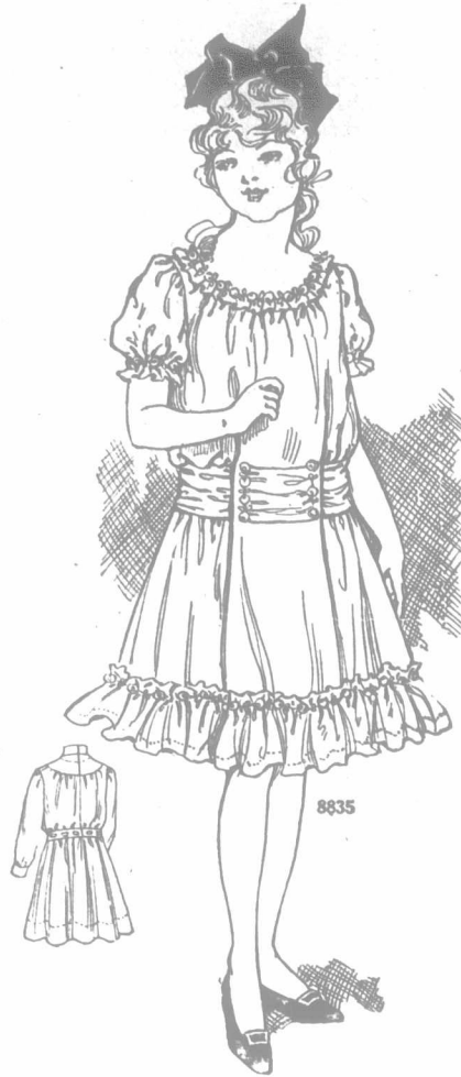
8835 (With Basting Line and Added Seam Allowance) Girl's Dress, 8 to 14 years.