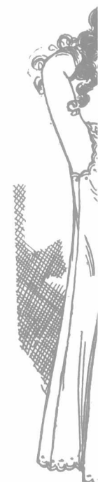
8836 (With Basting Line and Added Seam Allowance) Girl's Garment.