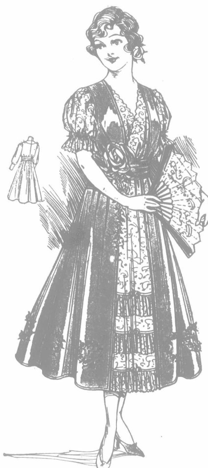
8842 (With Basting Line and Added Seam Allowance) One-Piece Gown for Misses and Small Women, 16 and 18 years.