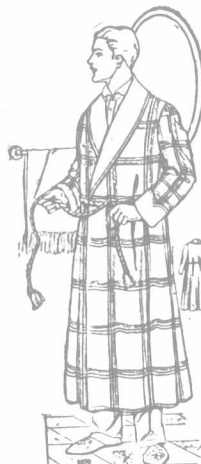
8850 Men's Bathrobe, Small 36 or 38, Medium 40 or 42, Large 44 or 46 breast.