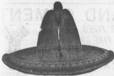
Design No. 1007.

Very Neat and Artistic For Man and Beast.