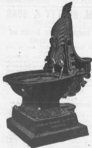
Design No. 1010.

Very Neat and Artistic For Man and Beast.