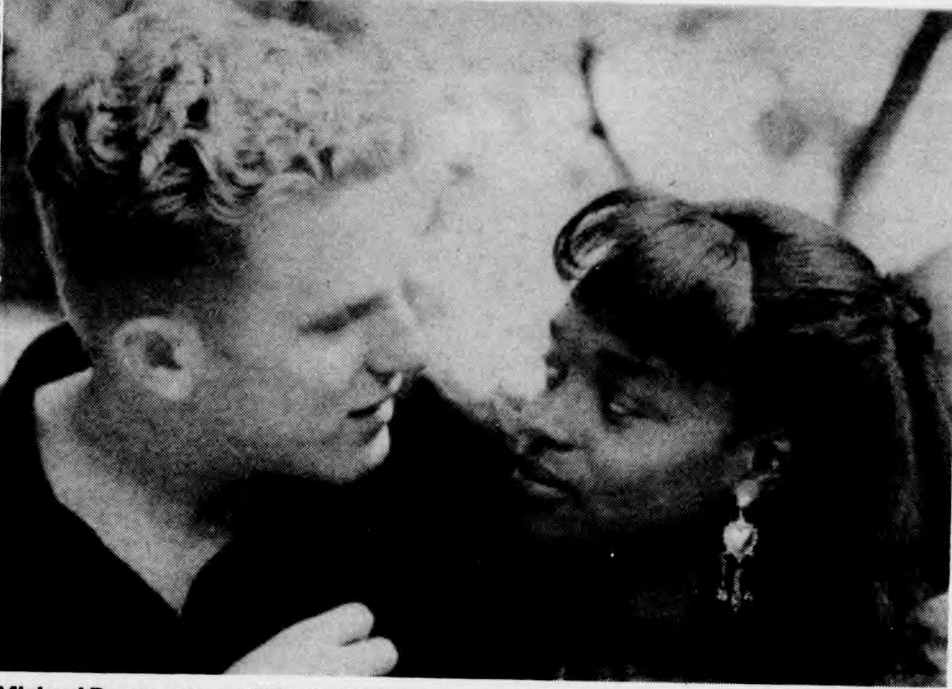
Michael Rapaport and N'Bushe Wright star in Zebra Head, which explores the theme of whites idolizing Black culture. While films by Black filmmakers continue to reach small audiences, film festivals gear their ads toward a white mainstream market.

AIDS is a growing concern in Black communities; forums are needed to address these problems. It's a Powerful Thang and In Search of Our Fathers show the variety of