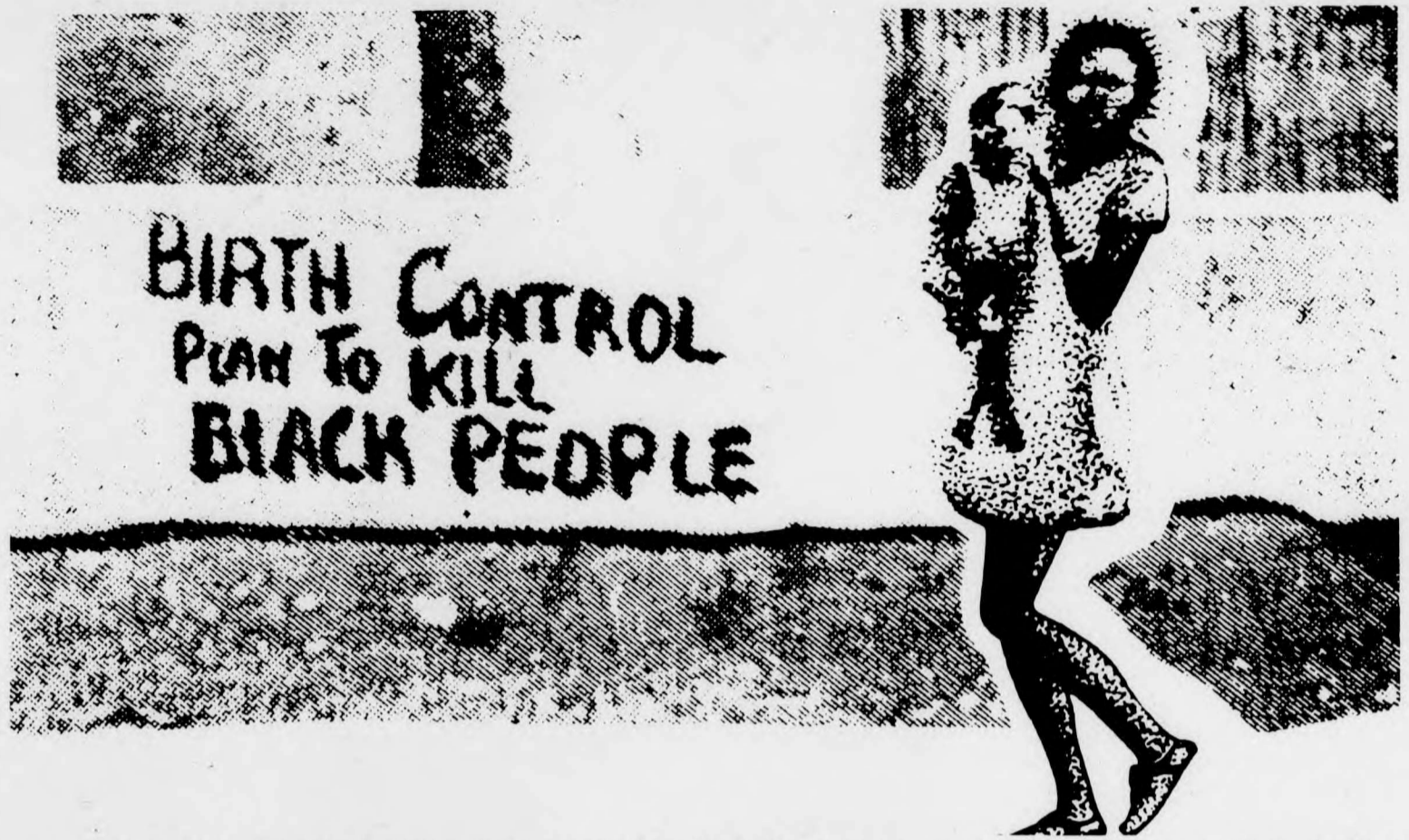
In more than 80 countries throughout the world, women are force-injected with Depo Provera, an intravenous contraceptive. Depo Provera is given to the most vulnerable women: Third World women, Black women, poor women, disabled women. Like all intrusive birth control methods, it allows men to maintain sexual power over women, assumes women's responsibility for birth control and assumes women's availability for sexual intercourse. Depo Provera makes it difficult for women to say 'no.' Image by Catherine O'Neil from Depo Provera: From stories to struggles, published by Women's Health Interaction, 58 Arthur Street, Ottawa K1R 7B9

It is the power and violence of the Gulf