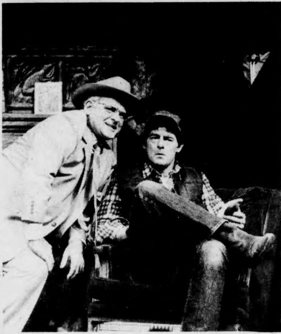
A scene from Booster McCrane, P.M.