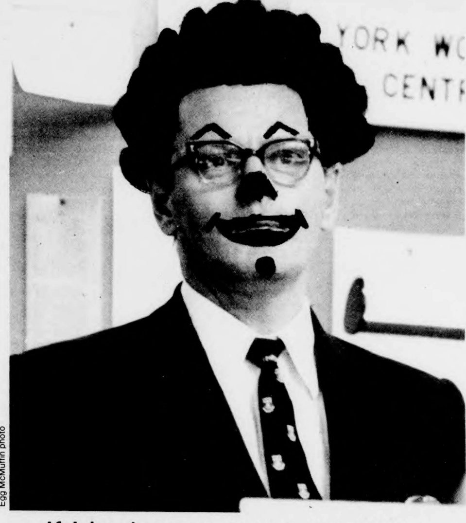
If I had my way we would be turning people out with degrees every four weeks