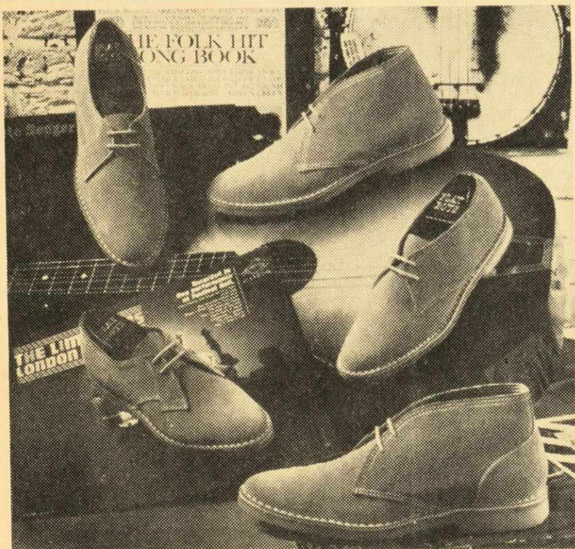
Here are the Village Look PLAYBOYS. All suede. Putty beige. Grey. Faded blue. All styles available in "His"—$10.95. "Hers"—$8.95. ($1 higher west of Winnipeg)

FINEST IN MEN'S WEARING APPAREL 10% DISCOUNT TO ALL STUDENTS HALIFAX