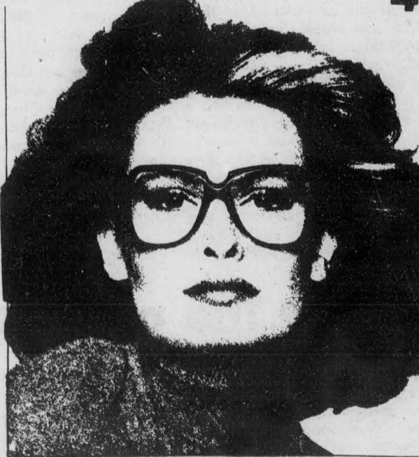
• prescription eyeglasses