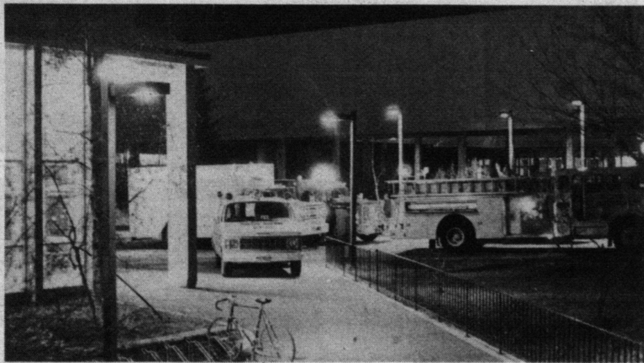
Paper's seizure began with hot times