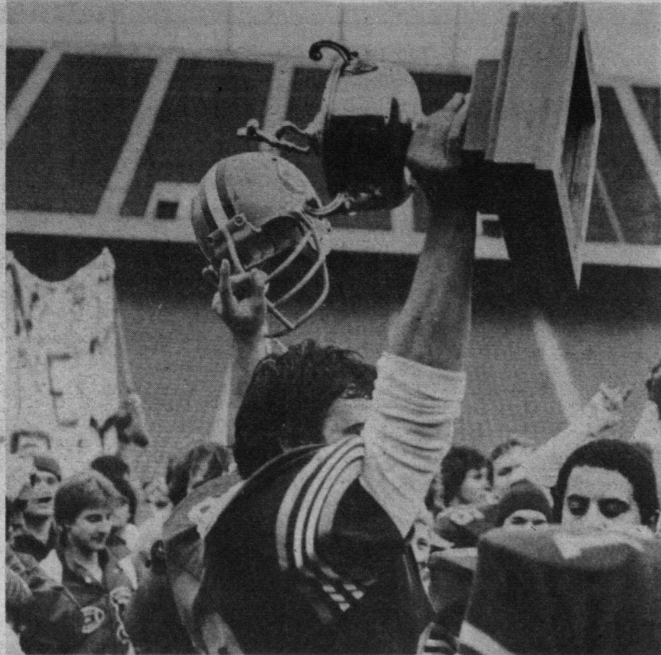
Bears take the Western Conference football final