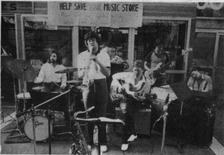
Musicians try to save SU Music store but are destined to fail