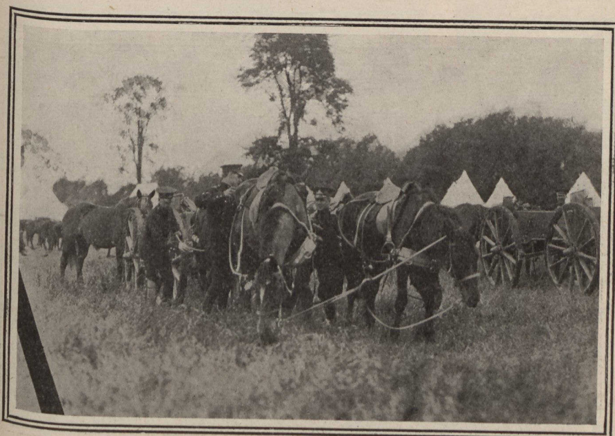
The Finish of the Day's Work.