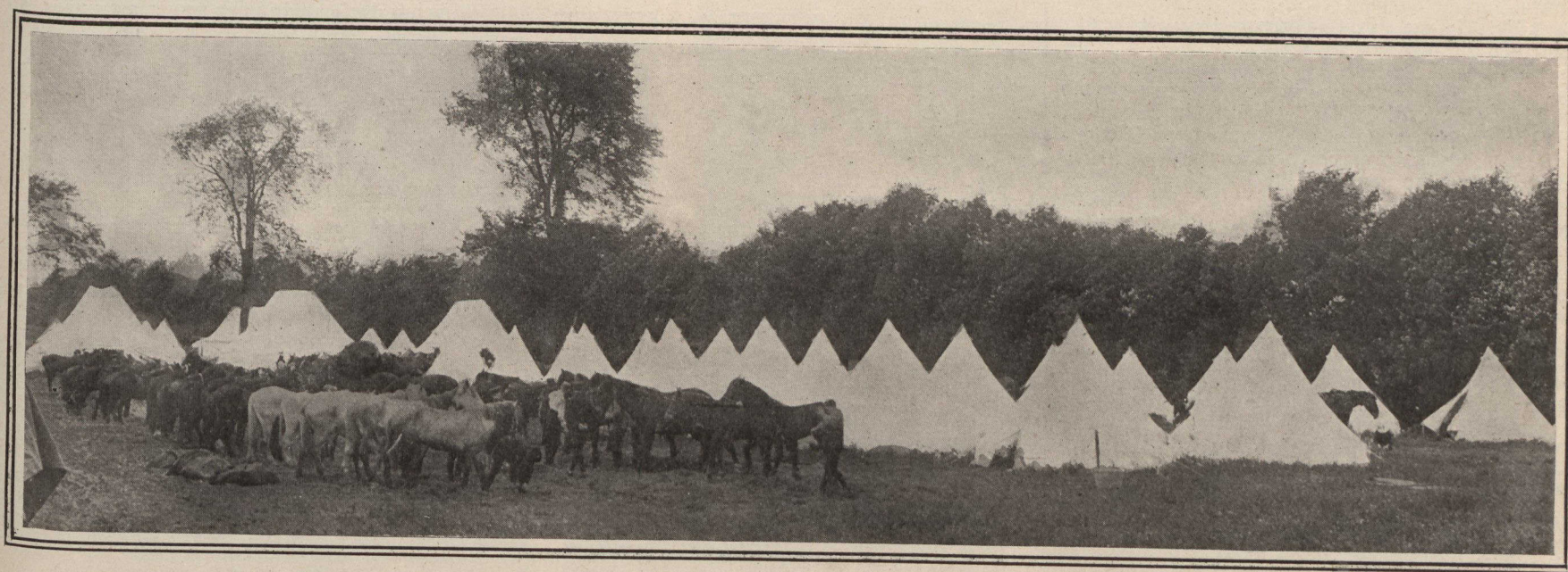
Artillery Camp at Notre Dame de Grace, near Montreal.