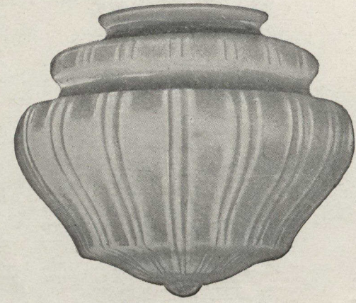
No. 9070. Grecian Lantern.

It is cheaper, too, than the old way, for less candlepower will produce more illumination, so great is the deflecting and diffusing effect of this chemically perfect glass.