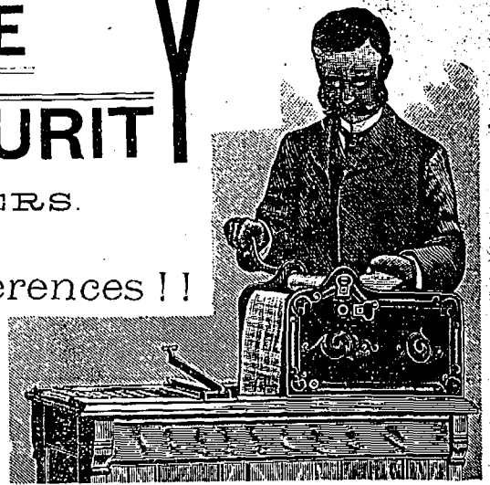
RAPID ROLLER DAMP-LEAF COPIER.

The SHANNON CABINET and RAPID ROLLER COPIER in use, afford the most perfect system for filing together Letters and Copies of answers to same.