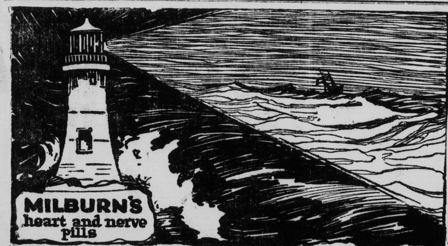
MILBURN'S heart and nerve pills