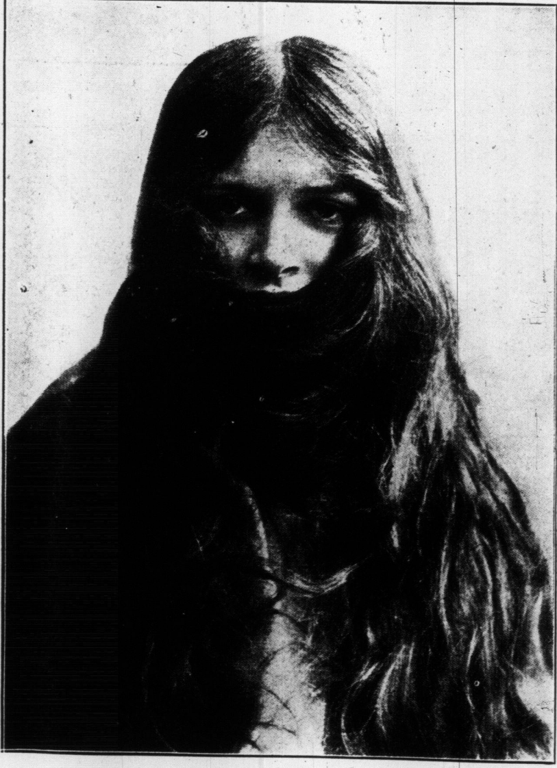
VEILED IN HER TRESSES—MISS GLADYS COOPER, WHO IS PLAYING IN THE LATE ST. JOHN HANKIN'S "SYLVAN" PIECE, "THE CONSTANT LOVER," AT THE ROYALTY, LONDON, AND ALSO IN MR. JOHN GALSWORTHY'S "THE PIGEON."