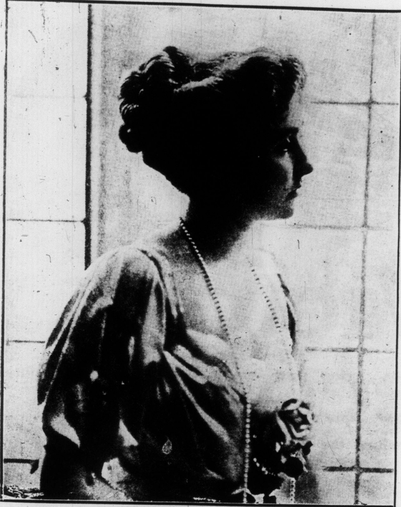
LATEST PORTRAIT OF PRINCESS PATRICIA OF CONNAUGHT, WHO WAS TWENTY-SIX ON THE 17TH OF MARCH.