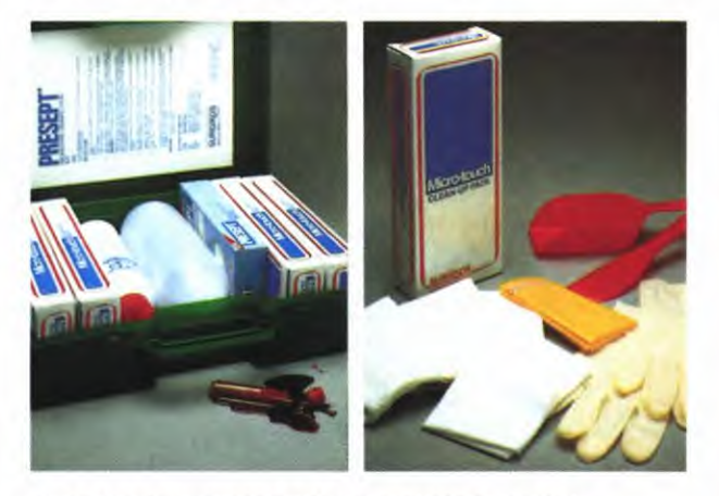
Biohazard disinfection kits and infection control products from Surgikos.

Established in 1965. Surgikos Canada Inc. is a subsidiary of Johnson & Johnson Corp., New Brunswick, New Jersey, U.S.A. The company is composed of four distinct marketing divisions that provide a wide and diverse range of products and services. The Surgikos division is a recognized leader in infection control, encompassing micro-organism transmission prevention and destruction. Major products include surgical and examination latex gloves, disposable hospital linens and apparel, disinfecting solutions and sterilization systems and components. The Codman division is a leading supplier of quality neuro-spinal diagnostic and surgical products in Canada while the lolab Intraocular division specializes in surgical ophthalmic products. The pharmaceutical division markets pharmaceuticals for diagnostic, therapeutic and surgical applications through ophthalmic professionals.