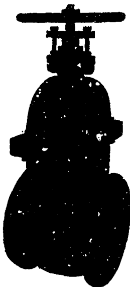
Flanged End Gate Valve with Hand Wheel.