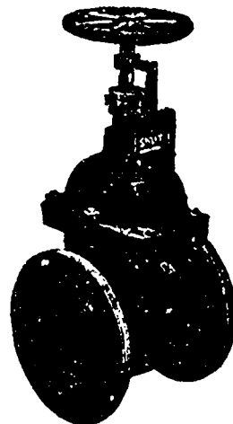
Indicator Gate Valves.

Railway Supplies, Structural and Ornamental Iron Work