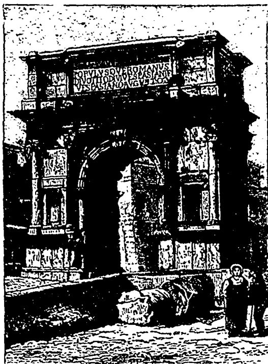
Arch of Titus at Rome.

Arch of Titus . A triumphal arch erected at Rome, and still remaining