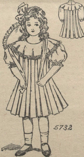
NO. 5732.—A DRESS FOR THE LITTLE MAID.

In ordering patterns from catalogue, please quote page of catalogue as well as number of pattern, and size.