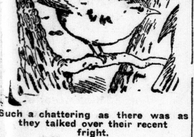
Such a chattering as there was as they talked over their recent fright.

So in no time at all all those little people were as happy and care-free as ever. That is, as were but Welcome Robin. That had been Welcome Robin's first experience with Terror the Goshawk, and he couldn't get