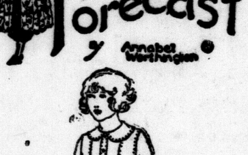
A Jaunty School Dress With Bloomers.

Do mothers of small girls love frocks for them with a hand-made touch? Most assuredly they do, and while most mothers can't always afford to buy such frocks ready-made, the only alternative is to make them at home.