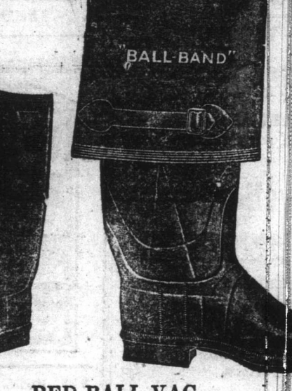
RED BALL VAC.

Best on the market. Double wear in each pair.