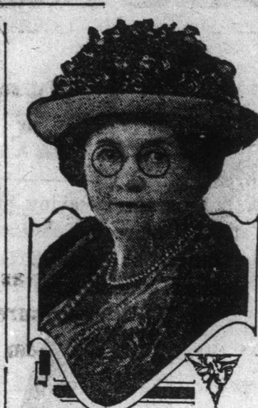
Prominent Buffalo, N. Y. Club

Woman and Suffragist. awful pain I almost gave up hope. This spell left me without any energy and so weak I could hardly walk across the room.