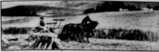
As It Looked Before the Storm