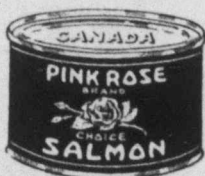
96 x 1/2-lb. net tins