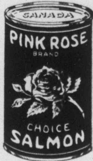
48 x 1-lb. net tins.

Ask for PINK ROSE BRAND CANNED SALMON and Avoid Disappointment