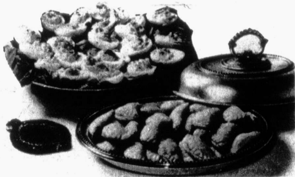
Turkey puffs, devilled eggs and hot bread combine to make an appetizing Sunday night supper.