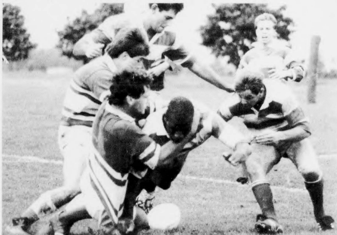
THIS ISN'T WRESTLING! Teammates come to this Yeoman's rescue as two 'Stangs put on the stranglehold.

In picking up their second win of the year, against one loss, the Yeomen moved into a four-way tie for first in their division along with McMaster, Waterloo and their opponents this Saturday, the Queen's Golden Gaels.