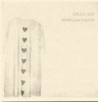
Veruca Salt American Thighs Minty Fresh/DGC/MCA 9/10

ok. not much time to do this album justice. not much time for grammar either. let's see...first of all, for everyone thinking that they've heard the name Veruca Salt was the bitchy character in the book Charlie and the Chocolate Factory . now you know.