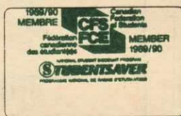
Canadian Federation of Students (CFS) Membership Card

THE ADVENTURE OF AVIREX, ONE OF THE MOST IMPORTANT BRANDS OF LEATHER JACKETS IN THE WORLD