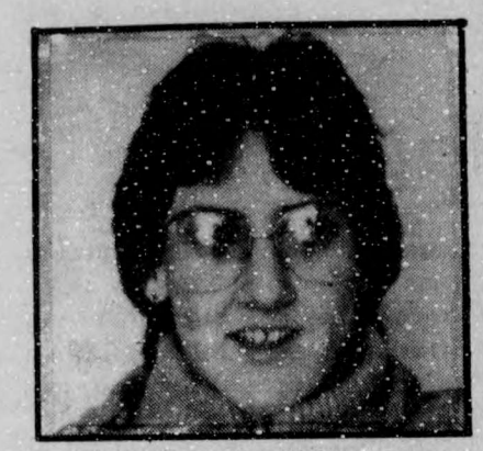
"No, I don't live on campus."