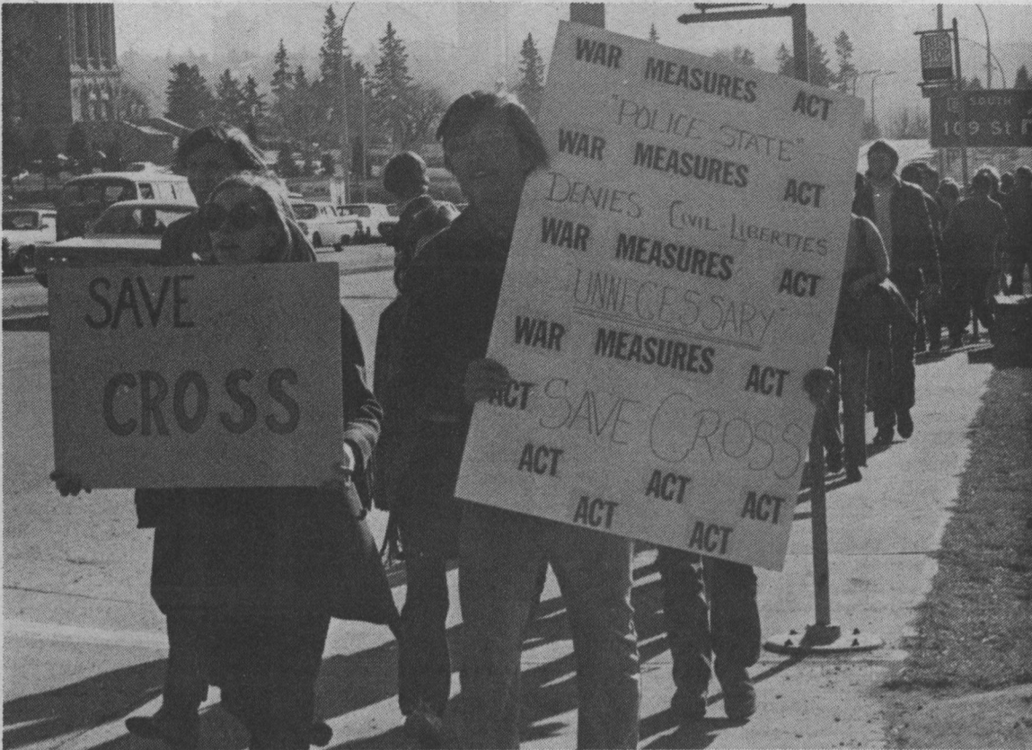
An Edmonton demonstration against the War Measures Act.