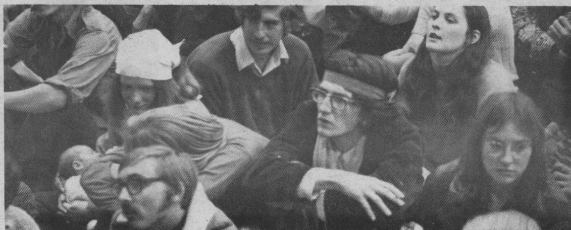
Hippies on grass, a common sight in 1970/71.