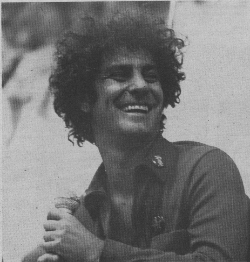
Yippie leader Abbie Hoffman, in Edmonton.