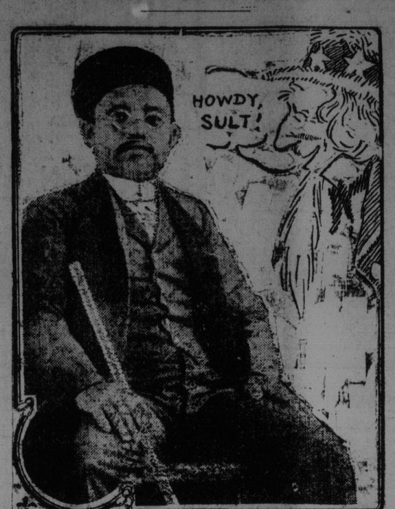
The Sultan in His First American Suit of Clothes.