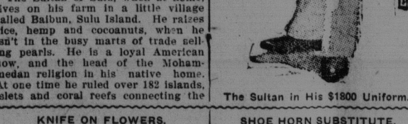
The Sultan in His $1800 Uniform.

The Sultan of Sulu, when at home, lives on his farm in a little village called Balbun, Sulu Island. He raises rice, hemp and coconuts, when he isn't in the busy market of trade selling pearls. He is a loyal American now, and the head of the Mohammedan religion in his native home. At one time he ruled over 182 islands, islets and coral reefs connecting the Philippines with the Island of Borneo. He ascended the throne in 1884, is now forty years old, and has no children.