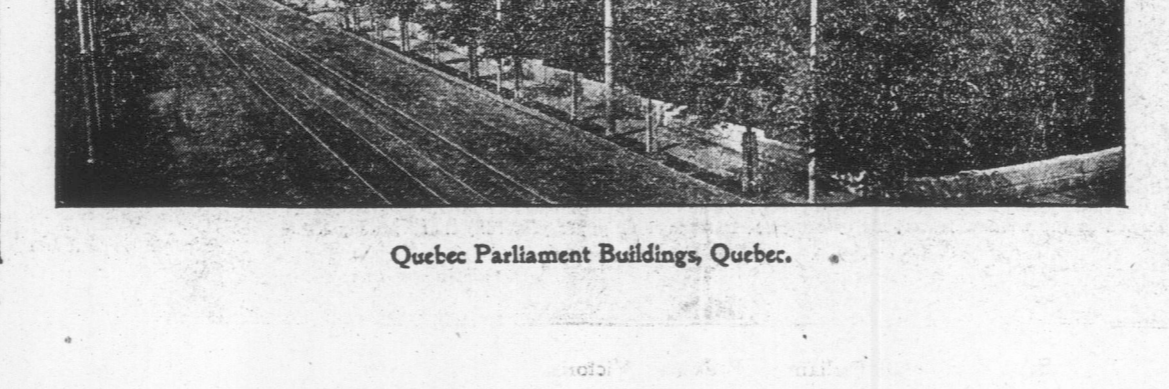
Quebec Parliament Buildings, Quebec.