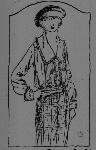
Shop 8 King Square

or my men had preceded them by ten minutes. "On Wednesday evening I was in a restaurant in Brooklyn looking things over when this same man came in. He sat at another table, and immediately began to tell the people who ran the place that the thing he desired most was to get me in a room with himself and prove to me that he was the better man. I decided to give him a chance to do so. "Yesterday morning, when the entire force of men was in the office I locked the door leading to the corridor (the office is on the fourth floor of the Federal building in Brooklyn). I then closed the door leading to the office of the young lady stenographers and walked over to where this man was sitting. I told him to get on his feet. When he stood up I told him he was a skunk and that he was not fit company for the other men in the office, and that as he had evinced a desire to meet me man to man I was ready to accommodate him.