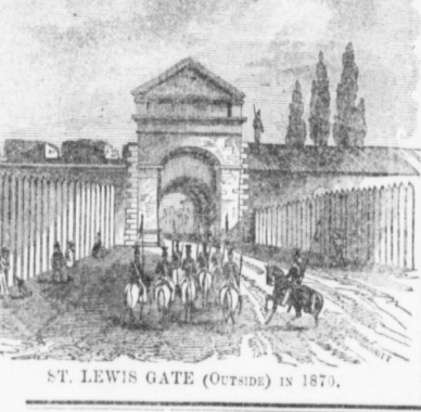
ST. LEWIS GATE (Outside) in 1870.