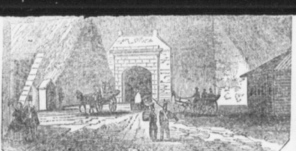
OLD ST. JOHN'S GATE (Inside) in 1864.