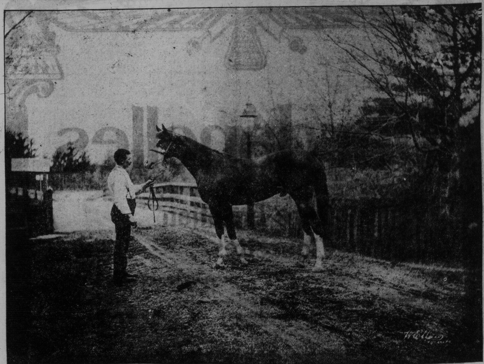
KIRKFIELD STABLE'S WAR WHOOP .CH. C., 3, BY WHICKHAM-LADY LIGHTFOOT.

Constantinople, May 22.—It is said that the authorities contemplate destroying all Armenian villages in the Sassura district of Asia Minor, in order to prevent the concentration of insurgents in the mountains and the installation of the villagers on the plain where they may be better supervised.