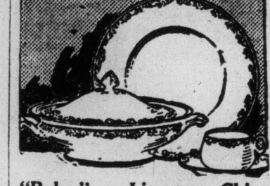
"Ruby," a Limoges China Dinner Set, $75.00 Beautiful quality Ahrenfeldt French Limoges China. Dainty rosebud and blue border decoration, coin gold handles. An open stock pattern. 97 pieces, pieces. Today, special, $35.00.