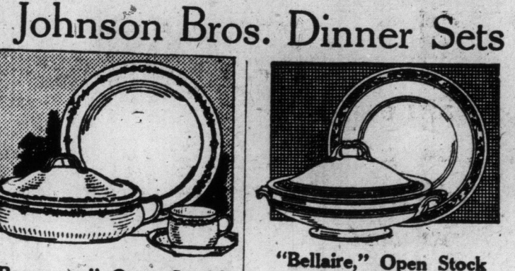
Bellaire," Open Stock Pattern, $35.00. A new decoration-a reproduc-

tion on Johnson Bros. ware, of a rich old Oriental design. pieces. Today, set, $75.00.