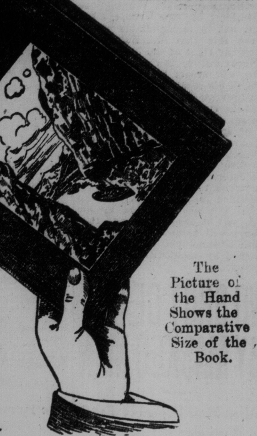
The Picture of the Hand Shows the Comparative Size of the Book.

An illustration cannot portray the beauties of this big $4 book bound in tropical red vellum cloth. It measures 9x12 inches in size.