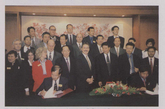
The 1998 Signing Ceremony between B.C. and Guangdong

As a coastal city, Shenzhen enjoys a beautiful landscape and an agreeable climate. Scenic spots such as Splendid China, the Chinese Folk Culture Village, the Window of the World, the Safari Park, the Botanical Garden and the Bathing Beach attract an increasing number of visitors from home and abroad. Shenzhen has seven golf courses of international standards that have held many national and international tournaments. There are 85 star-level hotels in Shenzhen, including 6 fivestar hotels and 4 four-star hotels. Over 2000 restaurants, both of Chinese and Western style, are located in Shenzhen.