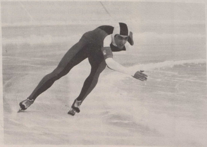
Gaetan Boucher, the world's number six-ranked 1 000-metre racer, enters his third Olympics this year.