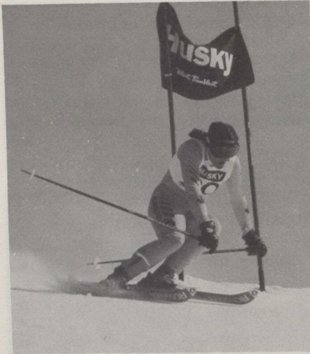
Athlete Information Bureau photos