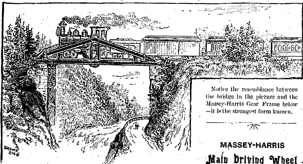
Notice the resemblance between the bridge in the picture and the Massey-Harris Gear Frame below—it is the strongest form known.

THE MASSEY PRESS, Massey St., Toronto, Ont.