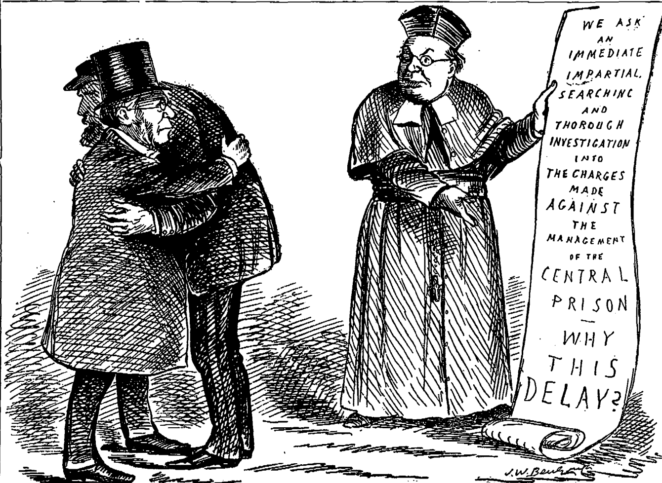
A REASONABLE REQUEST.

BRYCE BROS. THE LUMBER MERCHANTS AND BUILDERS. Save Notice by being your own landlord. Houses built quickly and on easy terms. Call and see us. Corner Berkeley and Front Streets, TORONTO.