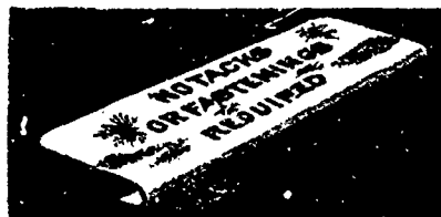
MEALEY STAIR PAD

Manufacturers of Wadded Carpet Lining and STAIR PADS Hamilton, Ont.