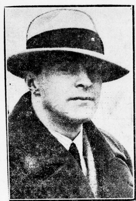
Bruce Bairnsfather, the creator of immortal "Old Bill," recently arrived back in England on the Aquitania, after a lengthy lecture tour in the United States and Canada