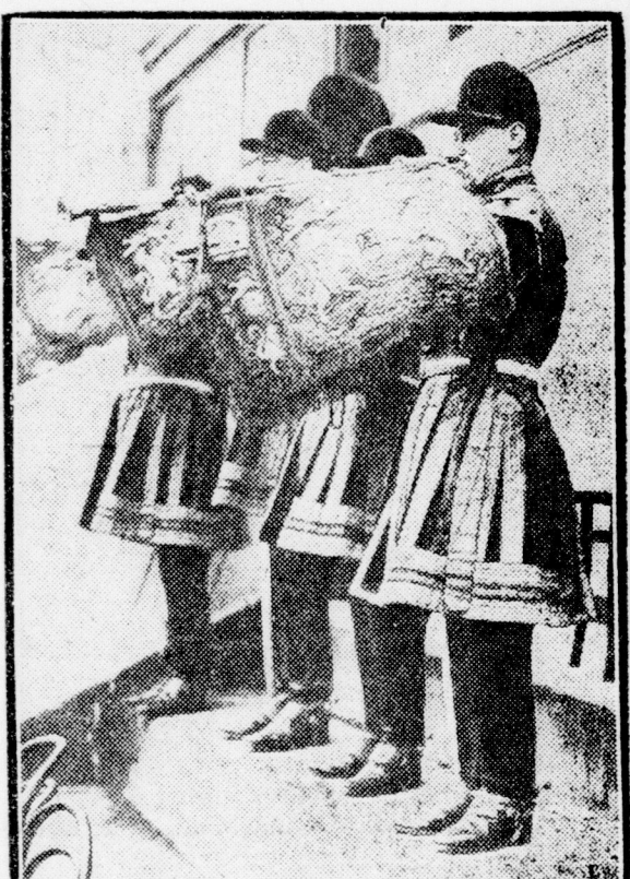
No, they're not sounding "cook-house." The occasion for the big noise was the official opening of the British Empire Exposition by King George at Wembley on April 23. A fanfare of trumpets followed the King's speech