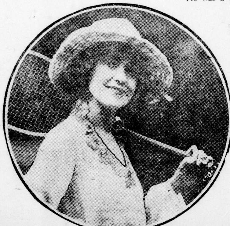
Movie stars seldom stage a successful come-back, but here's one who did—Florence Turner, who has just received the offer of a big contract to star in a series of American films