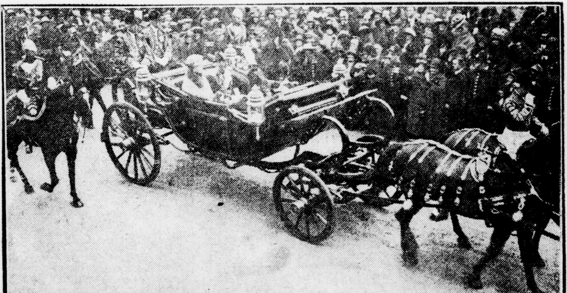
Huge crowds cheered lustily as the King and Queen arrived at the Wembley stadium to open the British Empire Exposition. Their majesties appeared in full state, drawn in the royal coach and four