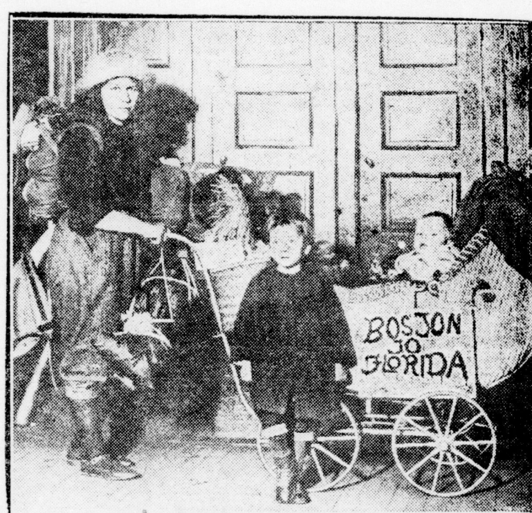
Deserted by her husband, this courageous woman started out to hike from Boston to the home of her people in Florida, taking with her her three-year-old daughter and a few months' old baby. The police took her into custody before she had left Boston behind her