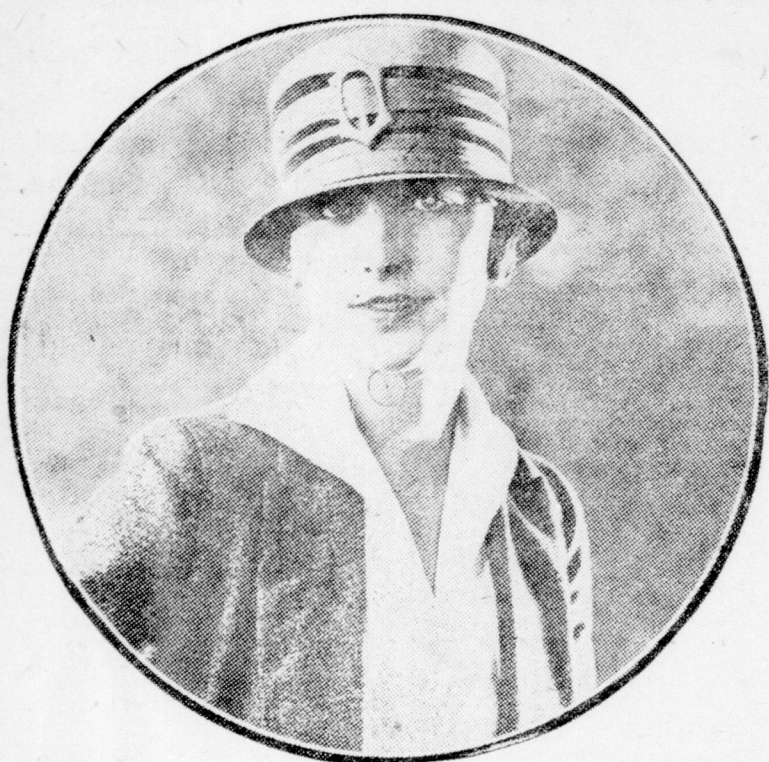
Tucked white crepe de chine with a convertible collar for either up or down wear, with groups of silk buttons, adds an air of nattiness to the season's new tailored suits