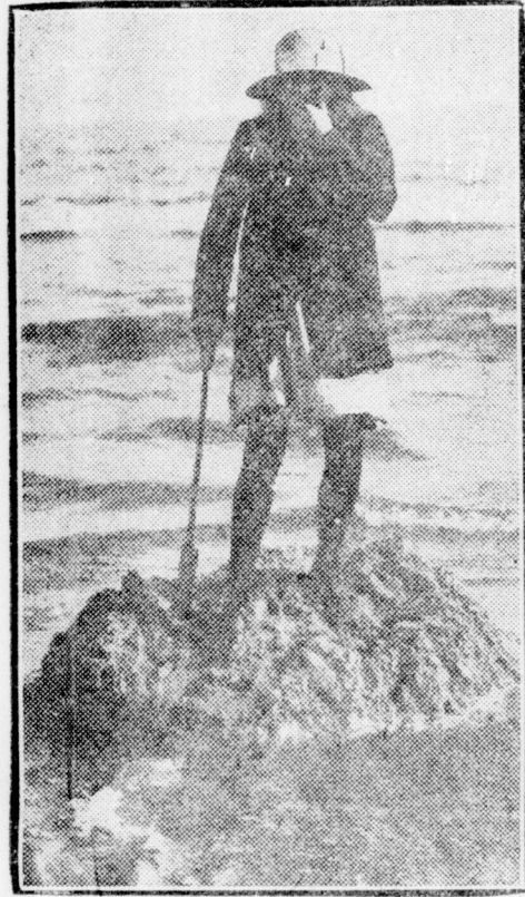
Marooned! The little girl doesn't seem to be very seriously worried about it, however, because a pair of wet feet is all that is necessary for her escape. The scene is at Bourne-mouth