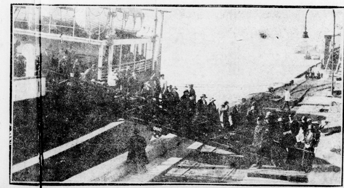
The recent arrival in Quebec of the largest liner on the Canadian Trans-Atlantic route, marked the commencement of the usual spring influx of passengers to Canada from the Old Country. The photo shows the passengers getting their "land-legs"