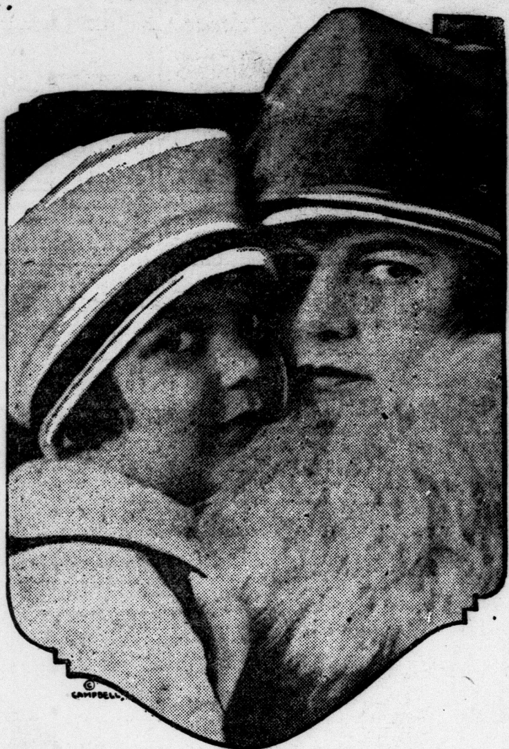
Jackie Loves His Mama.

THE popular little motion picture actor, Jackie Coogan, and his mother, who declares her little sonny is a regular "little angel," who never causes her a minute's worry. Yes, isn't it nice to be a million-dollar baby, though?