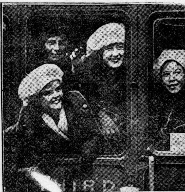
Off for the Land of the Maples.

ORPHANS from the Barnardo Homes, England, smile happily as they leave by railway for a port whence they will sail to Canada for adoption. They anxiously look forward to their arrival in the Dominion, where they are confident happy homes await them. These poor, little, parentless waifs are eager for any new adventure which offers them a chance to be as other children.