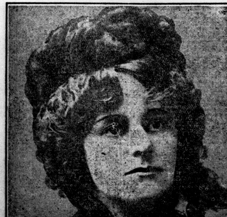
Ireland's "Joan of Arc."

MAUDE GONNA MacBRIDE, Irish feminist leader, is referred to lovingly by Sinn Feiners as their "Joan of Arc." She recently was expelled from the gallery of the Irish Parliament for heckling speakers of the pro-treaty faction.