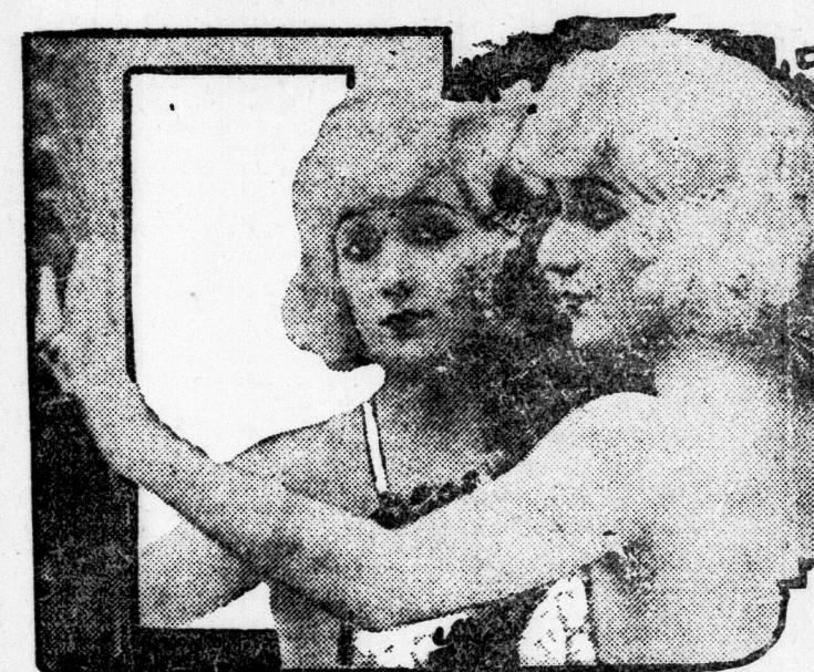
Has Prettiest Arms in France.