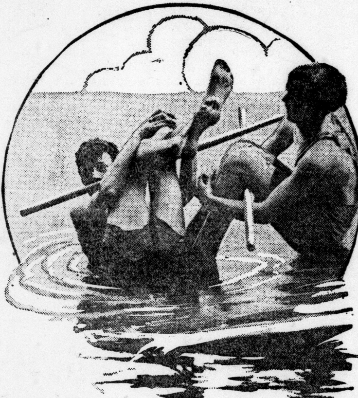
Yell for Newt, She's a Raring!

TRY this some day when you go swimming. Lock your elbows and knees around a stick and try to buck the other feller off the raft. But say, fellows, take a bit of good advice. Don't cut the handle off ma's best broom for a stick, as she might spoil your fun a bit.