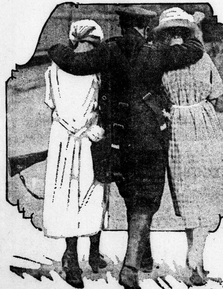
Hurrah! A Truce in Ireland.

AFTER the recent heavy fighting in County Cork one of the Free State soldiers was snapped "presenting arms" to two fair damsels, and then doing an about face for scenes of fairer memories. The soldiery in Ireland, while subjected to great strain, have off moments, such as the above, which give a short respite of calm to the turbulence of their life.