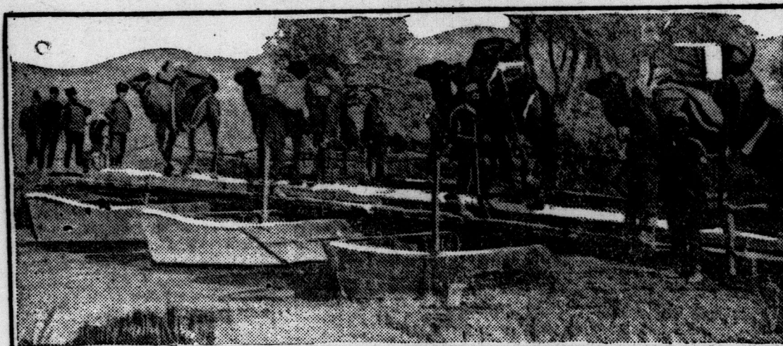
Camels Bear Burdens of War.

CAMELS do all the heavy slugging in the zone occupied by the warring factions in Asia Minor. Picture shows a train of the animals passing over a closely-guarded bridge during the Turkish advance against the British.