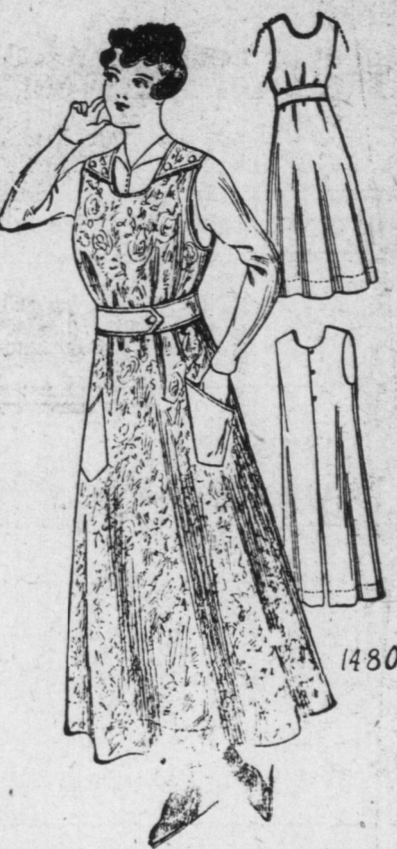
Ladies' Apron, with or Without Belt. Gingham, cretonne satin, chambray, drill, linen, percale, cambric, sateen or lawn are all suitable for this style. The back may be finished with or without a closing. The belt and pockets may be omitted.

This style is fine for the kitchen for artist or office use. The Pattern is cut in 3 sizes: Small, Medium and Large. It requires 5 1/2 yards of 36 inch material for a medium size. A Pattern of this illustration mailed to any address on receipt of 40c. in silver or stamps.