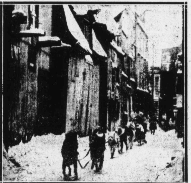
Mush! Mush! Through the streets of Quebec. Even driving through these historic by-ways in the calesche does not have the charm of a run through them in a husky-drawn carriage. There's a tang in the air and such an atmosphere as could be found nowhere else. Exhilarating and full of color and life. This is the Chateau Frontenac team.