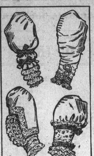
GROUP OF NEW SLEEVES.

Navy blue, the real dark blue that used to be considered so fashionable and attractive, has again come into favor. And black costumes for winter