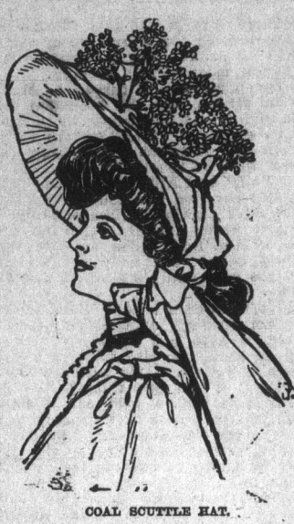
COAL SCUTTLE HAT.

The day of the white glove is over. It is now no longer the correct thing in Paris to wear white gloves upon any occasions except full evening dress affairs. For the street, afternoons, receptions, garden parties or any such use tan suede is the thing. Another shade which is also greatly in vogue for wear with elaborate light gowns is a sort of flesh color that closely im-