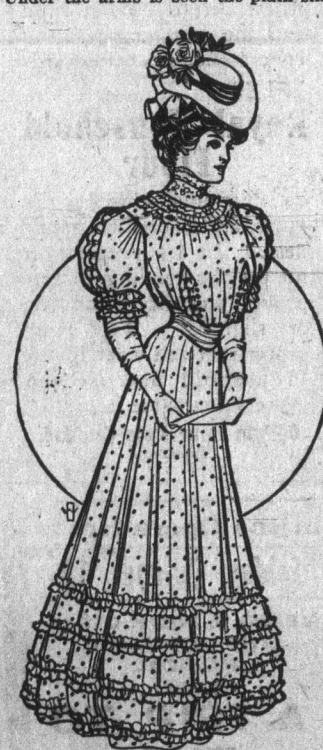
GOWN OF FOULARD.

Silk handkerchiefs are making pretty golf and tennis shirts. Five handkerchiefs thirty-two inches square of soft silk in solid centers and varicolored borders are required. The plain part is plaited on the shoulders and a cuff border is set into the shoulder seams and brought tapering to the waist line. Under the arms is seen the plain silk.