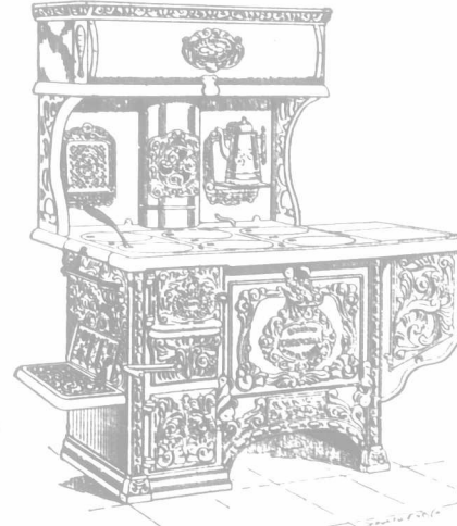
"CORNWALL" STEEL RANGE.